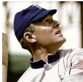
"Wahoo" Sam Crawford